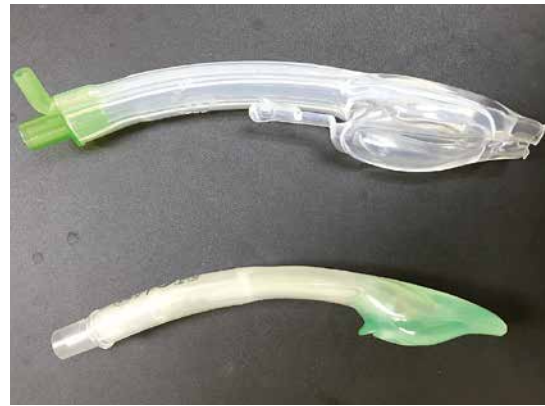
FIGURE 2. Comparison of i-gel and Baska Mask supraglottic airway devices from lateral view; top: Baska Mask, bottom: i-gel

insertion and eliminates the potential for rotation; and the epiglottic rest reduces the possibility of epiglottic 'down folding' and airway obstruction [4, 5].