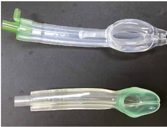
FIGURE 1. Comparison of i-gel and Baska Mask supraglottic airway devices from anterior view; top: Baska Mask, bottom: i-gel